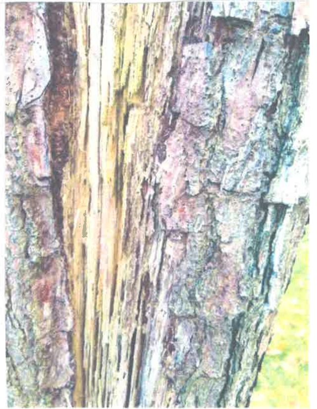
Tree # 2