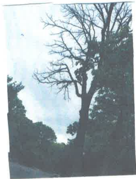
Tree # 1